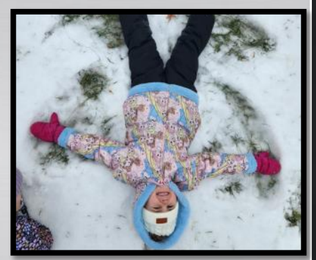
Student at ECC having fun in the snow!

Our school utilizes the SchoolMessenger system to deliver text messages straight to your mobile phone with important information about events, school closings, safety alerts and more. Our families can participate in this service just by sending a text message of "Y" or "Yes" to our school's short code number, 67587. You can also opt out of these messages at any time by simply replying to one of our messages with "Stop".