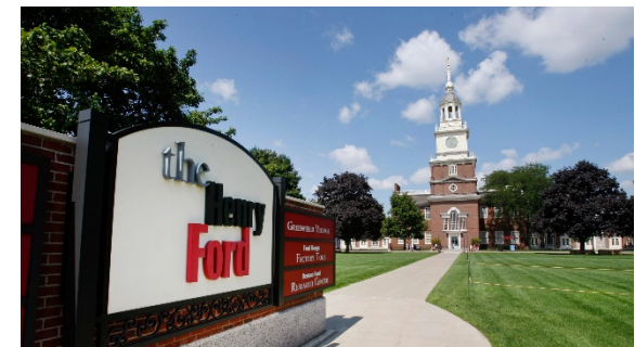
Henry Ford Museum