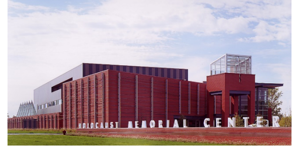
Holocaust Memorial Center